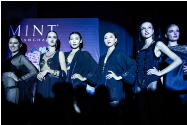
LA PERLA Show 2012 Fall&Winter Collection "Oriental Suite" on Asian Peony 2012 Oct