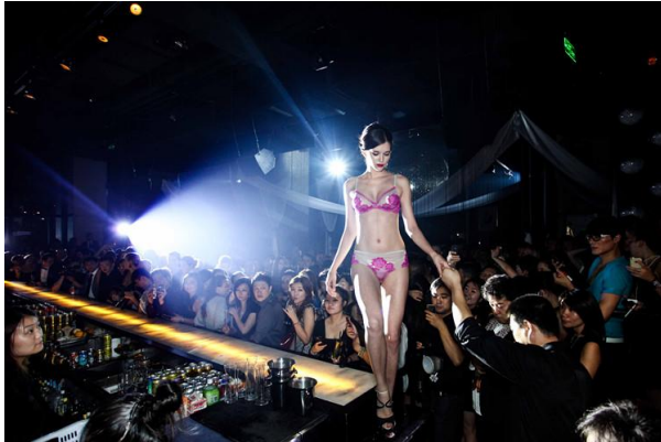
LA PERLA Show on Black Swan Party 2012 July at M1NT Shanghai